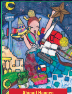
Abigail Haugen 5th Grade - CCD6