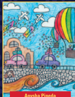
Anysha Pineda 5th Grade - CCD9