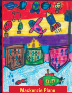
Mackenzie Plane 2nd Grade - CCD3