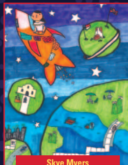
Skye Myers 4th Grade - CCD8