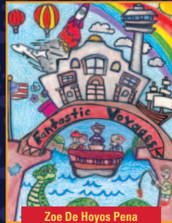
Zoe De Hoyos Pena 4th Grade - CCD4