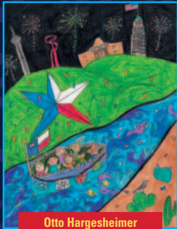
Otto Hargesheimer 5th Grade - CCD1