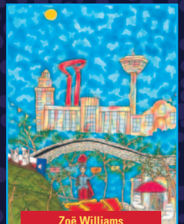
Zoë Williams 5th Grade - Non-CCD