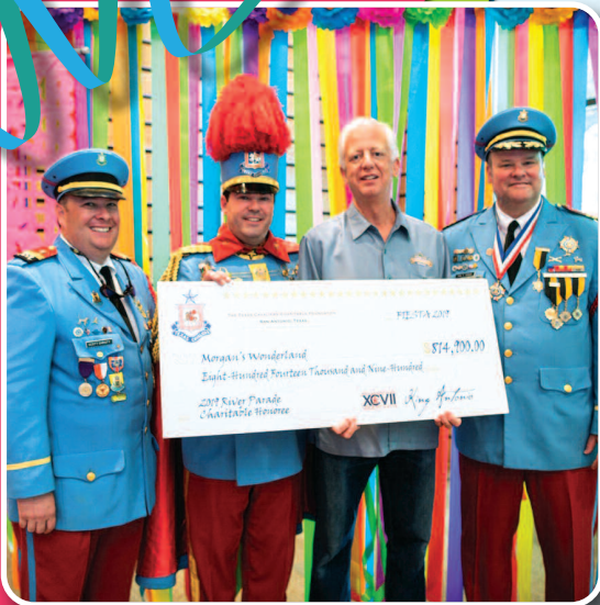
Over $800K to Morgan's Wonderland!