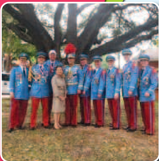
Site of the Texas Cavaliers Welcome Center at St. PJ's.